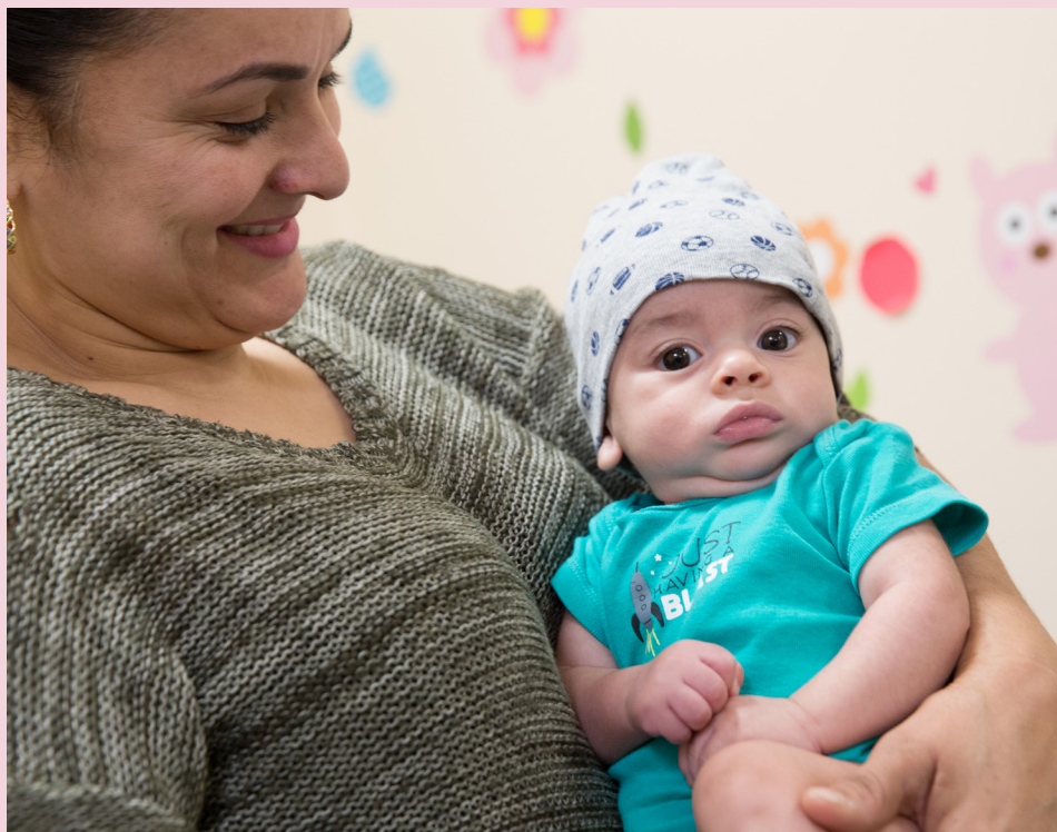
Staff from all of GLFHC’s clinical sites and administrative offices, in many different roles and departments of the organization, participated in giving to patients like these through the “Access to Care” Fund.

In the most recent Annual Appeal campaign, titled “GLFHC Staff Cares,” a full third of current health center staff participated in giving back to the organization. The six-week campaign kicked off on Mon-